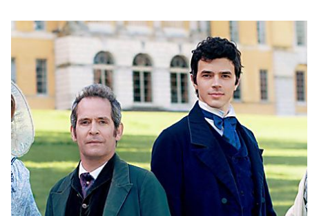
Done with Downton Abbey? Watch this next