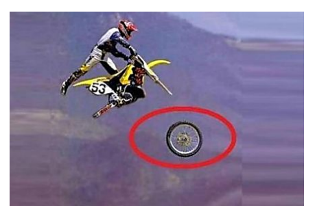
50 People Having Worse Days Than You