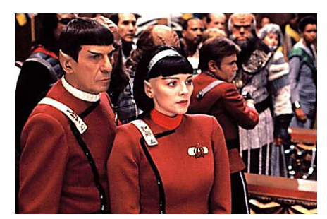
9 Celebrities You Didn't Realize Were on Star Trek