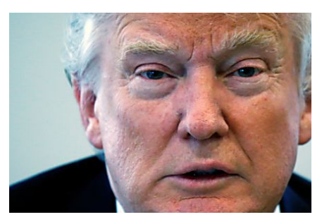
Donald Trump's Mortgage Payoff Tip Is Genius