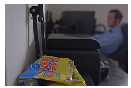
Uncovering The Truth Behind The Swedish Fish Theory